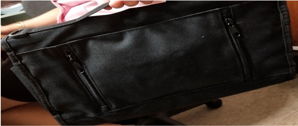
Item No. 7- Mosquito Monitoring Kit Bag